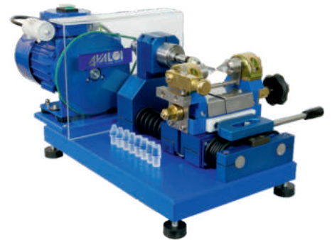
○ DRILLING MACHINE WK1