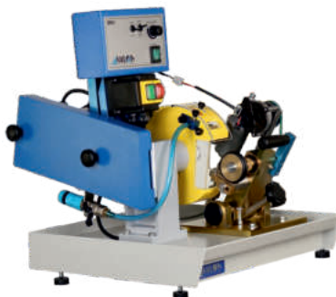
○ BALL SIZING MACHINE SKU