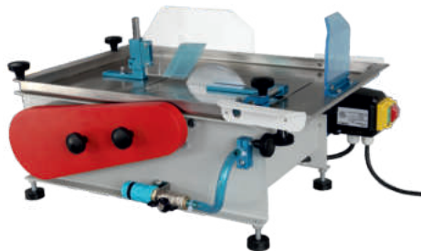
○ SAWING MACHINE P2