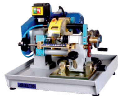
○ CYLINDRICAL GRINDING MACHINE SZK