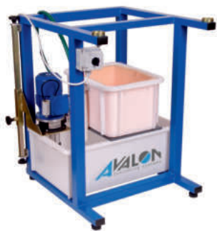
○ BASE WITH PUMP PBM