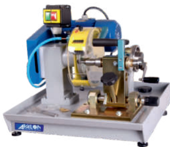
○ CABOUCHON GRINDING MACHINE SK2